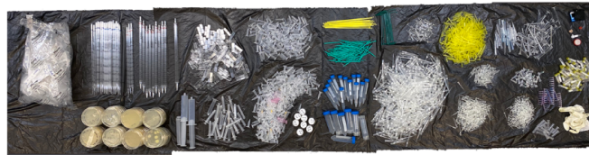
plastic waste from four days by 12 scientists (June 2-5)

Green Labs Austria aims to connect Austrian and international laboratories that share the vision of more sustainable research